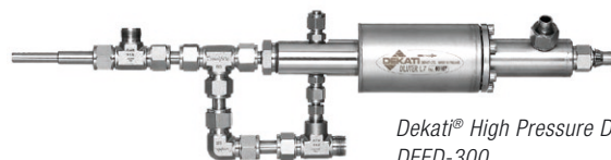
Dekati® High Pressure Diluter DEED-300